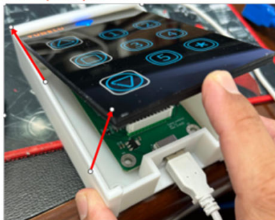
How to open panel